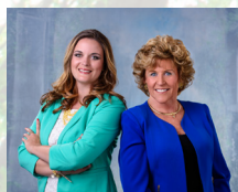
Bock Insurance Agency

Monday Music in the Woods is presented by: Bock Insurance Agency, Country Fair, and National Fuel, with additional support from Lavery Brewing Company.