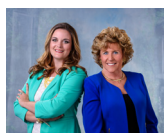
Bock Insurance Agency